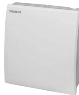
QPA20... Series Room Air Quality Sensor.