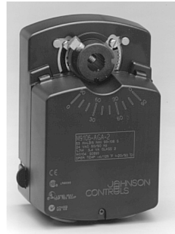
Figure 1: M9106-xGx-2 Non-spring Return Actuator

The M9106-xGC-2 models are available with integral auxiliary switches to perform switching functions at any angle within the selected rotation range. GGx models feature 0 to 10 VDC position feedback, and the AGF models provide 10,000 ohm position feedback.