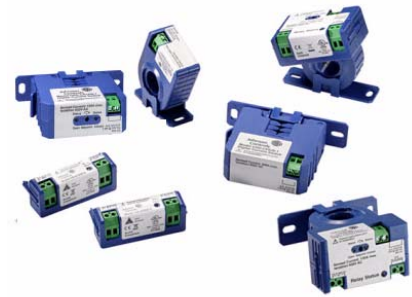
CSD Series Current Device

CSD-CA1G1-1 (split core with 24 V command relay)