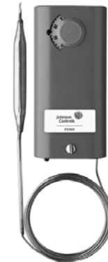
A19ABC-24 Remote Bulb Control