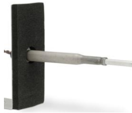
Rigid Probe – Bracket Mount