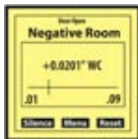
If pressure is Normal and Door is open, the screen is Yellow.