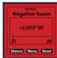
If pressure falls outside of preset limits (Alarmed State), the screen is Red.