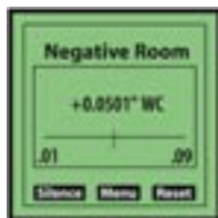
If pressure is Normal, the screen is Green.

The touch sensitive screen allows easy navigation of the menu tree to configure the SRPM for negative or positive room pressure control.