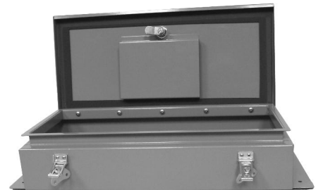
Watertight housing (Model FDBZ-WT)