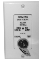
Remote alarm indicator (Model FDBZ492-RTL)