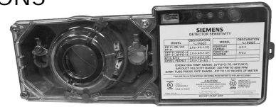
FDBZ-series of air-duct housings (FDBZ492, FDBZ492-HR, FDBZ492-R and FDBZ492-RP)