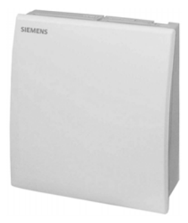
QPA20... Series Room Air Quality Sensor.