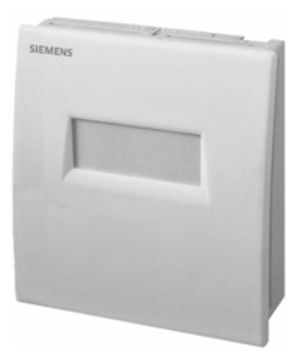
QPA20... Series Room Air Quality Sensor with Display.