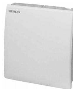
QPA20... Series Room Air Quality Sensor.