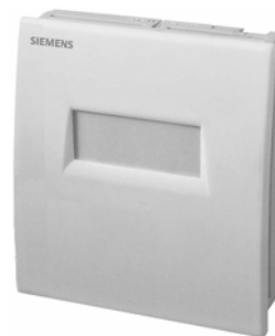
QPA20... Series Room Air Quality Sensor with Display.