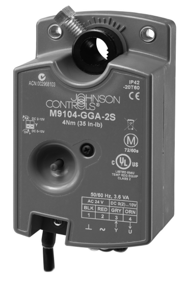
M9104 Series Electric Non-spring Return Actuator

The M9102 and M9104 Series Electric Non-Spring Return Actuators are designed to position balancing, control, round, and zone dampers in Heating, Ventilating, and Air Conditioning (HVAC) systems. These electric actuators are also designed to position blades in a VAV box, or they can be used in VVT two-position zone applications. Each actuator mounts directly to the surface in any convenient orientation using a single No. 10 self-drilling sheet metal screw (included with the actuator). No additional linkages or couplers are required. Electrical connections on the actuator are clearly labeled to simplify installation.