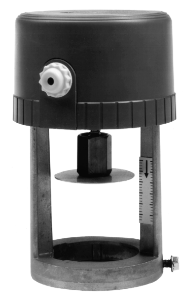
VA-715x Electric Valve Actuator

The VA-715x Series Actuator is used in conjunction with VG7000 Series Valves for hot water and chilled water systems. For VG7000 Series Valve options, refer to VG7000 Series Brass Trim Globe Valves with VA-715x Series Electric Actuators Catalog Page (LIT-1900084) on Page 173 and VG7000 Series Stainless Steel Trim Globe Valves with VA-715x Series Electric Actuators Catalog Page (LIT-1900090) on Page 184. For field mounting options, refer to VG7000 Series Bronze Globe Valves for Assembly in the Field Catalog Page (LIT-1924005) on Page 215.