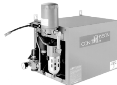
A-4400 Series Refrigerated Air Dryer with Optional Factory Mounted Air Purification System