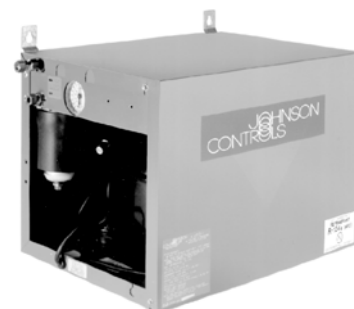
A-4400 Series Refrigerated Air Dryer without Optional Factory Mounted Air Purification System