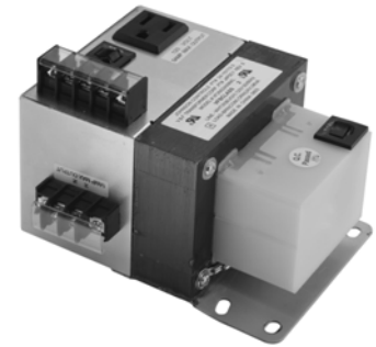
PAN-PWRSP 96 VA Power Supply

If the PAN-PWRSP power supply fails to operate within its specifications, replace the unit. For a replacement power supply, contact the nearest Johnson Controls® representative.