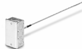
Figure 5. Duct (Averaging Rigid Temperature Sensor).