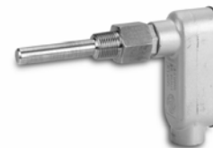
Figure 6. Liquid Immersion Temperature Sensor.