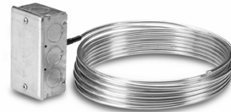
Figure 4. Duct (Averaging) Flexible Temperature Sensor.