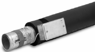
Figure 1. Surface Mounted Pipe Sensor.