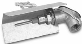
Figure 2. Outside Air Temperature Sensor.