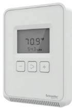
LCD with Buttons