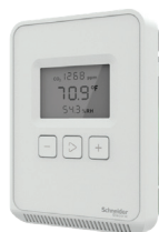
LCD with Buttons