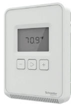
LCD with Buttons