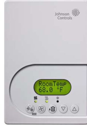
TEC2145-4 N2 Networked Thermostat Controller